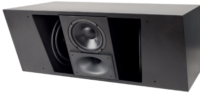
C102 Three-way Bi-amplified

Amplification Max. / Cont. SPL 1m Max. / Cont. Power Sens 1W/1m