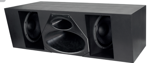
C124 Three-way Quad amplified

Three-way, Bi-amplified, 1x 8Ω + 1x 4Ω 137dB / 131 dB 1,800W+700W / 900W+350W 101dB