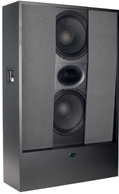
C212 Two-way Bi-amplified

Amplification Max. / Cont. SPL 1m Max. / Cont. Power Sens 1W/1m